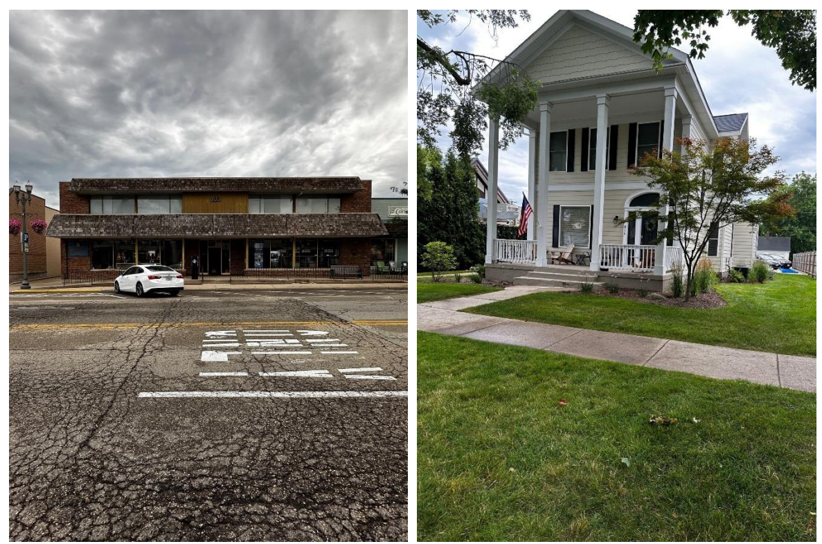
803 Main Street, Lake Geneva, WI