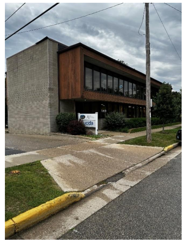
326 Center Street, Lake Geneva, WI