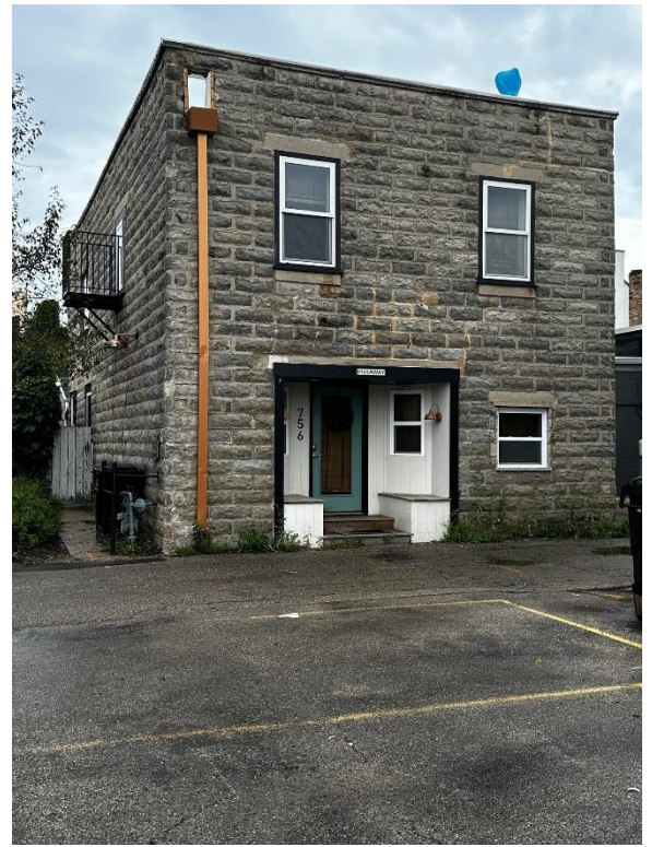
756 Geneva Street, Lake Geneva, WI