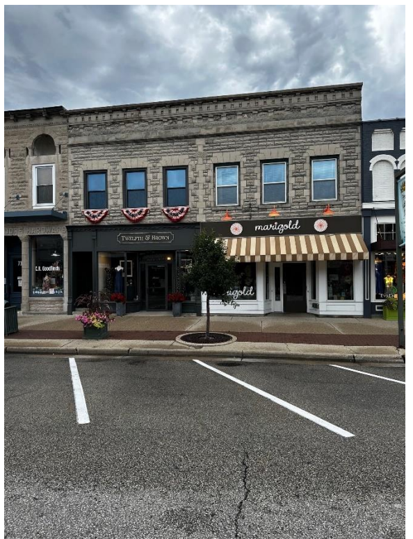
725 Main Street, Lake Geneva, WI