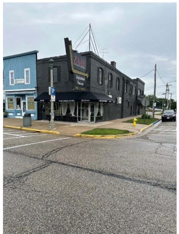
501 Broad Street, Lake Geneva, WI