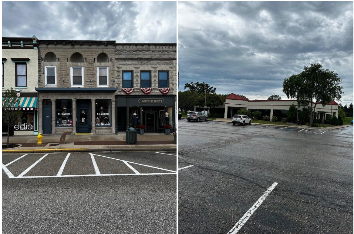
731 Main Street, Lake Geneva, WI