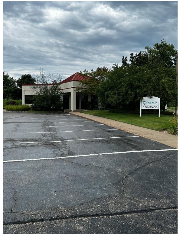
753 Geneva Parkway, Lake Geneva, WI